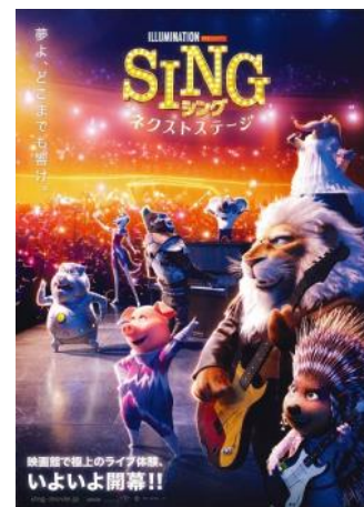
West Side Story

Obihiro Nishi 3 Minami 11 Tel: (0155) 20-1525