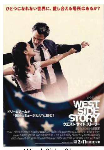
West Side Story

Obihiro Nishi 3 Minami 11 Tel: (0155) 20-1525