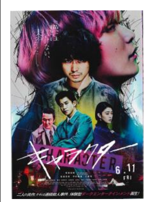
Movies (pg 4)