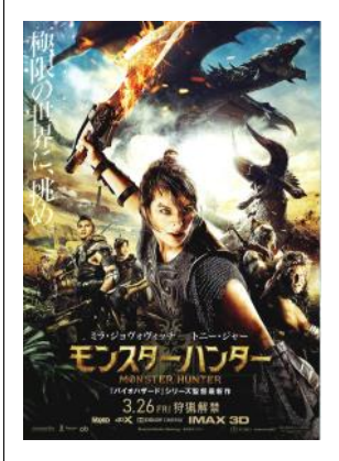
Movies (pg 4)