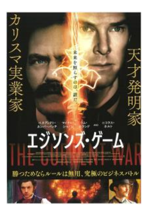
Movies (pg 4)