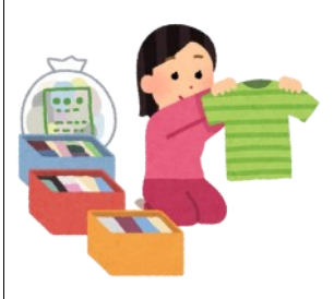
Goodbye Winter, Hello Spring! (pg 1, 3)