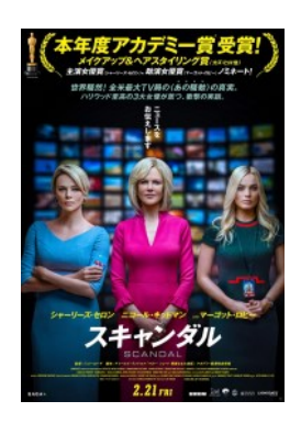
Movies (pg 4)