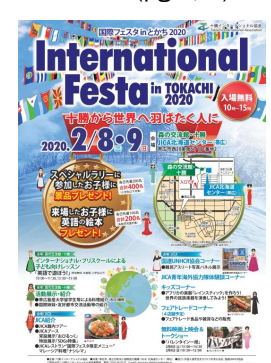
International Festa, Obihiro Ice Festival (pg 3)