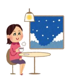
Don't be SAD! (pg 1, 3)