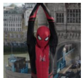
Movies (pg 4)