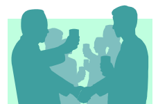
Events (pg 2, 4)