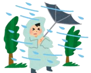
Disaster Prevention in Japan: Typhoon (pg 1, 3)