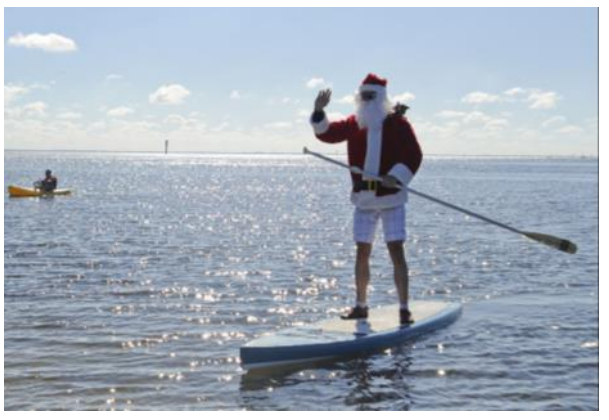
Photo credit: Macdill Air Force Base often find Santa out surfing or kayaking at the beach!

year long, our idea of a "winter wonder land" is different from the rest of the United States. After Santa is done sending presents to the children of the world, he and Mrs. Santa take a well-deserved break in Hawaii. On Christmas day, you can