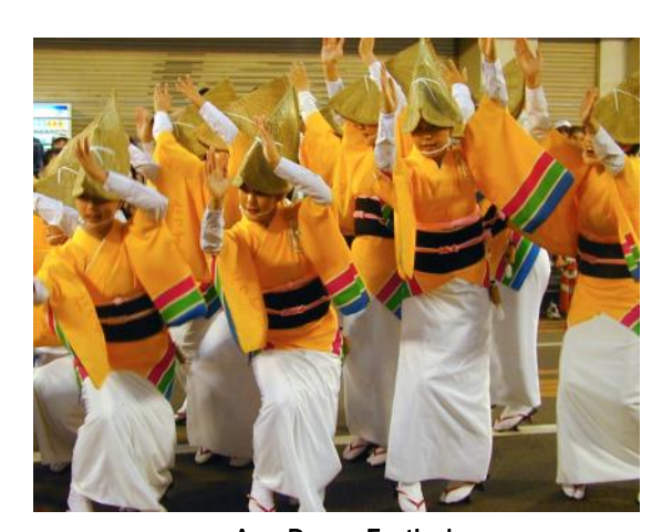
Awa Dance Festival

Bon odori , or bon dance, is considered one of the greatest summer attraction for tourists visiting Japan. Awa Dance Festival, the largest dance festival in Japan, brings in over 1,300,000 tourists every year and numbers are only growing.