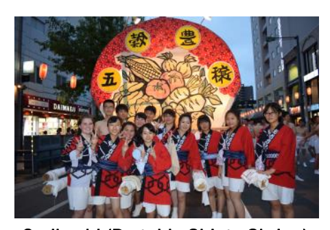
Omikoshi (Portable Shinto Shrine)

Participants can enjoy multiple performances, such as the Heigen Taiko Performance and Street Performances at Kita no Daichi.