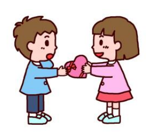
Culture: Valentine's Day in Japan (pg 3)