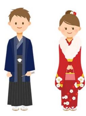
Coming of Age Traditions from Around the World (pg 1 & 3)