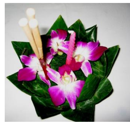
A typical Krathong basket made from decorated with orchid flowers, banana leaves, and incense

I was born in Chiangmai, a city in the north of Thailand. Chiangmai is a very nice city. In November, there is a very big and famous festival, called "Loi Krathong Festival (Thai: ลอยกระทง, IPA: [Ioː j krà? thon])." The literal translation of "Loi