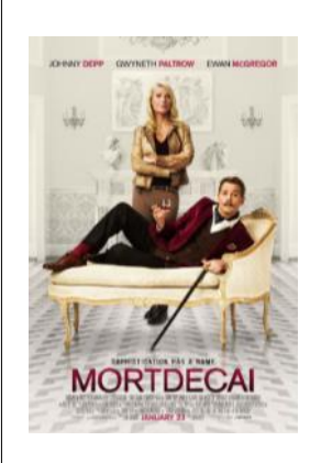
Movies & Chinese Corner (pg 4)

2月6日~2月8日、3会場で氷まつりが開催されますので、ぜひご来場をお願いします。