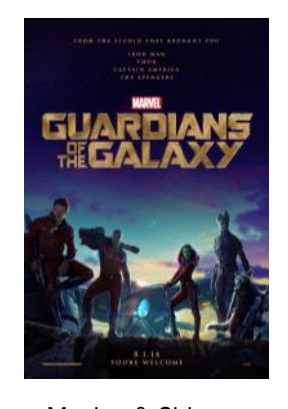
Movies & Chinese Corner (pg 4)