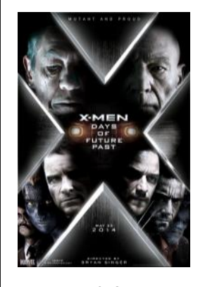
Movies & Chinese Corner (pg 4)