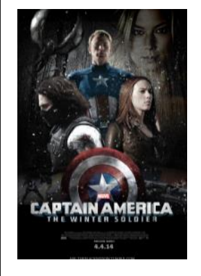
Movies (pg 4)