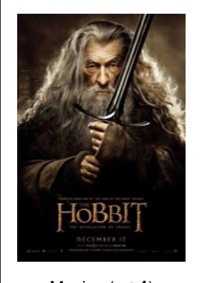
Movies (pg 4)