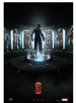
Movies (pg 4)