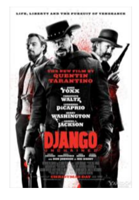
Movies (pg 4)