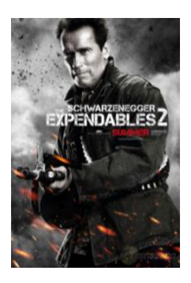
Movies (pg 4)